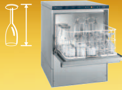
43 x 49 x H 58 cm