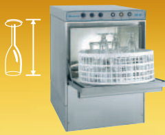
43 x 49 x H 60 cm