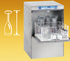
43 x 52 x H 68 cm