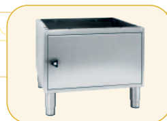
Base stand with front door

Highly reliable, built-in rinse additive dispenser. Detergent dispenser fitted upon request (excluded models CR43 | C35).